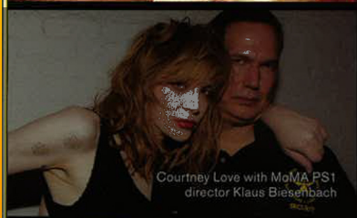
Courtney Love with MoMA PS1 director Klaus Biesenbach