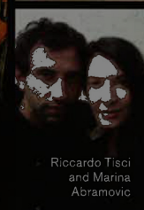
Riccardo Tisci and Marina Abramovic