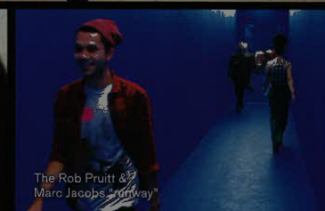
The Rob Pruitt & Marc Jacobs "runway"