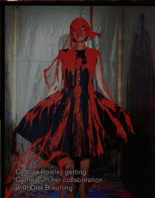
Cynthia Rowley getting "Carried" in her collaboration with Olaf Breuning