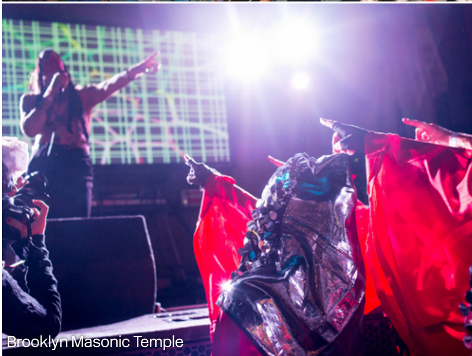
Brooklyn Masonic Temple