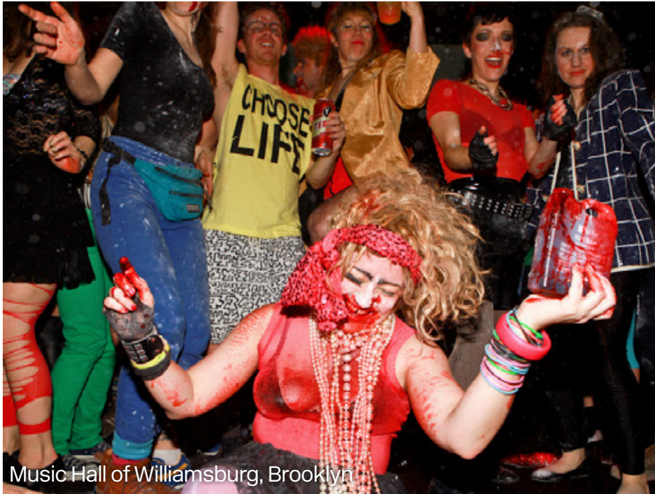
Music Hall of Williamsburg, Brooklyn