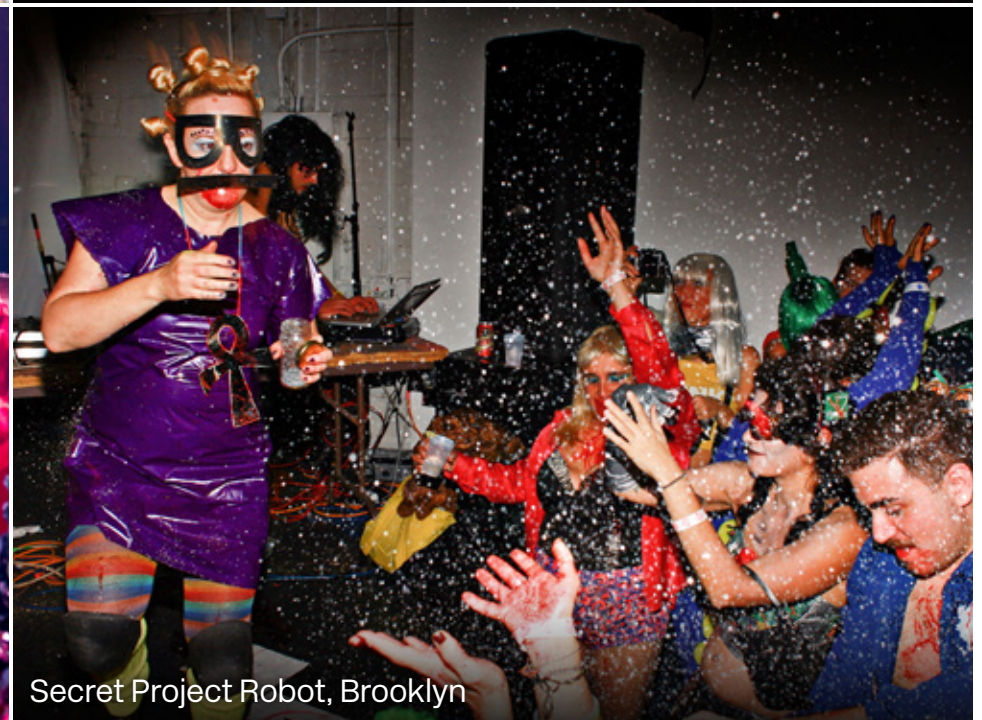
Secret Project Robot, Brooklyn