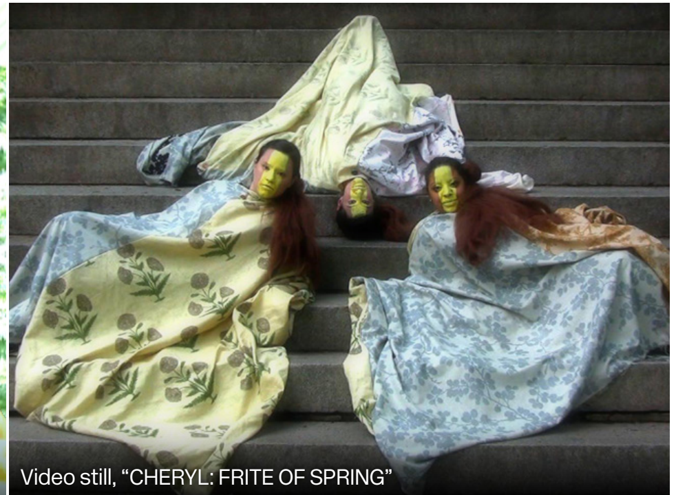
Video still, "CHERYL: FRITE OF SPRING"