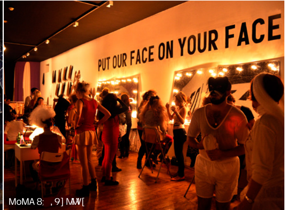
MoMA 8; , 9] MW[