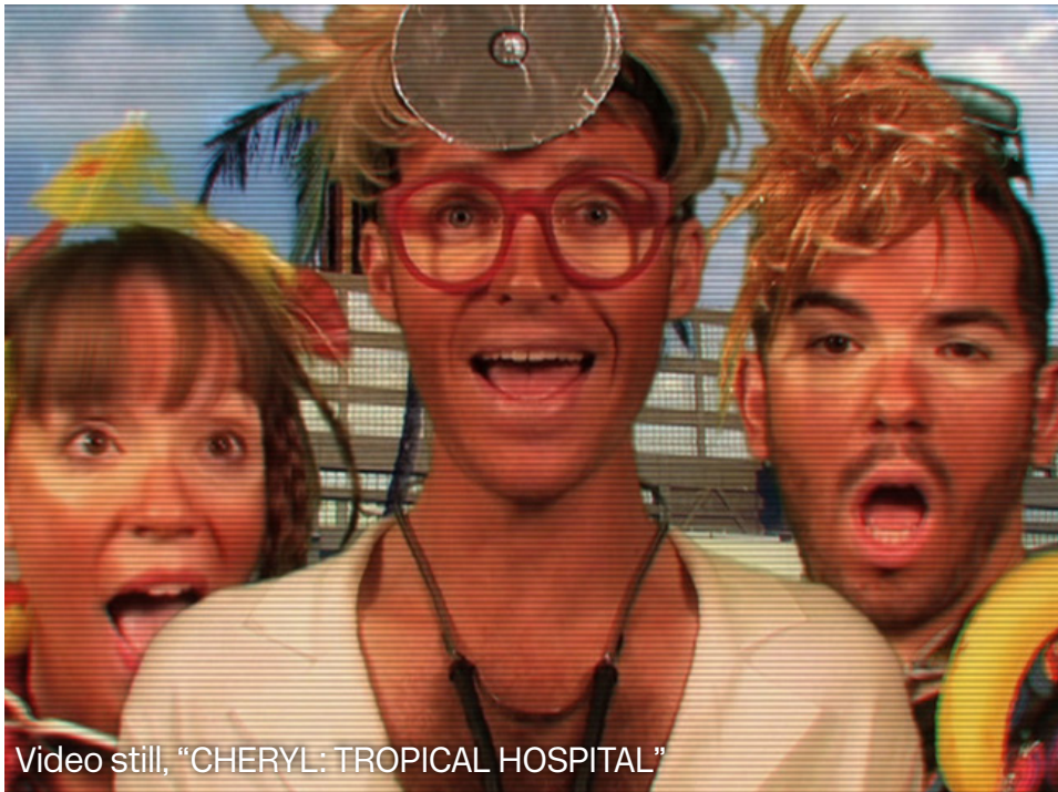
Video still, "CHERYL: TROPICAL HOSPITAL"