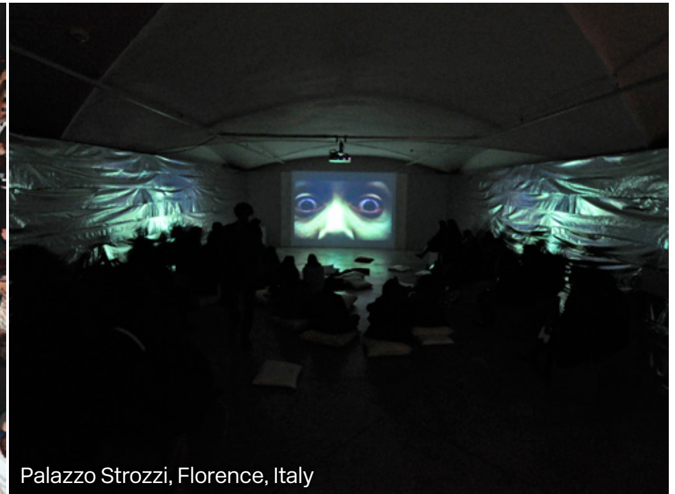
Palazzo Strozzi, Florence, Italy