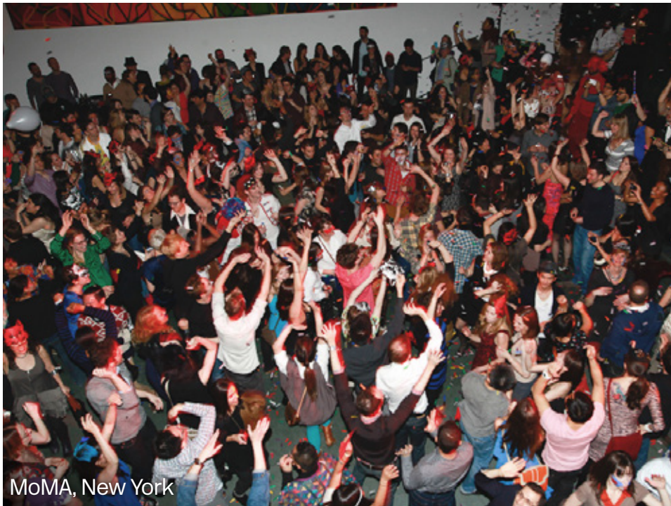
MoMA, New York