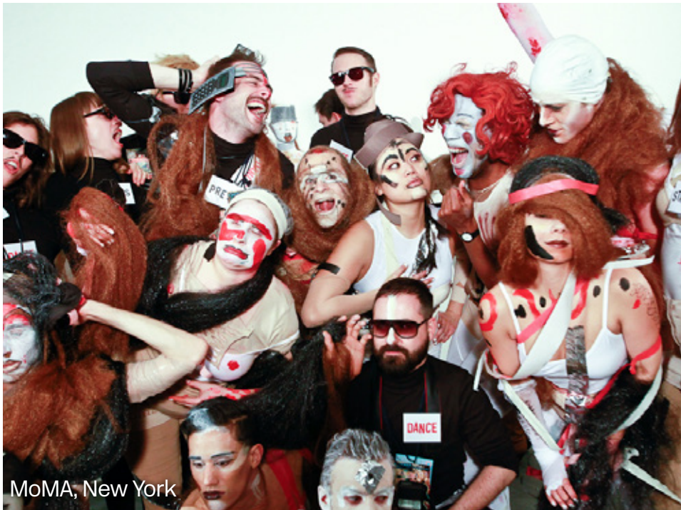
MoMA, New York